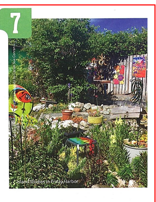
nwtravelmag.com | 52 Getaways 2019 | 29

The Anacortes Ferry Terminal is about 85 miles north of Seattle. Go to wsdot . wa.gov/ferries for the ferry schedule and fares. Check visitsanjuans.com for information about visiting Friday Harbor.