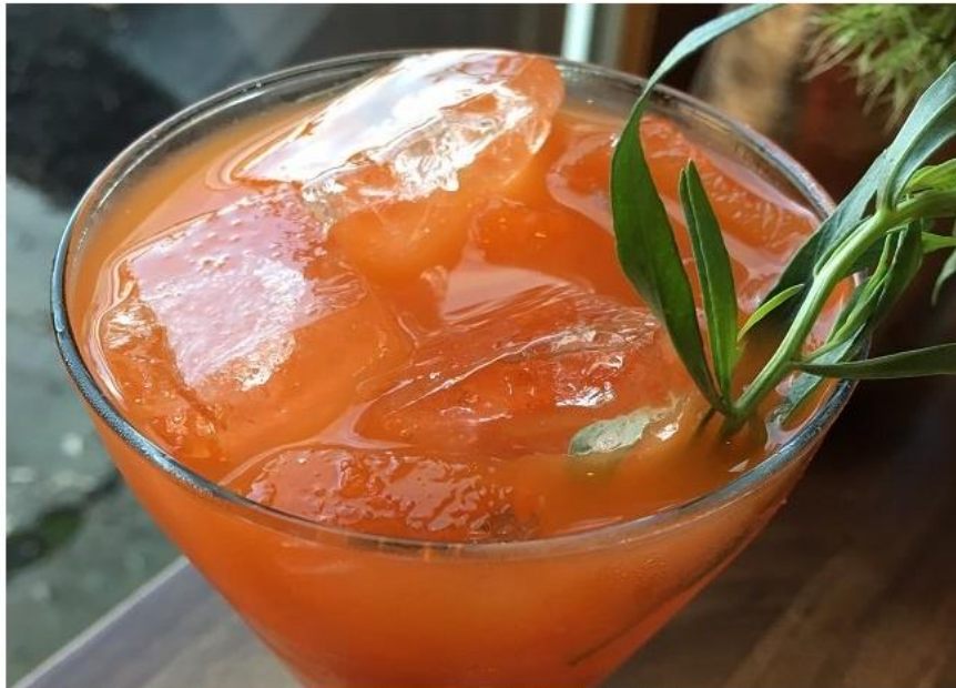
Friday Harbor House's signature bourbon cocktail features carrot juice.