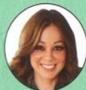
MARCELA'S CINNAMON ICE CREAM