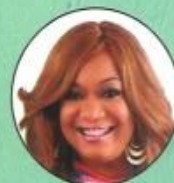
SUNNY'S HOMEMADE CHURROS