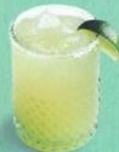
MARGARITAS AND MORE!