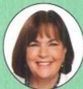
INA'S TRES LECHES CAKE