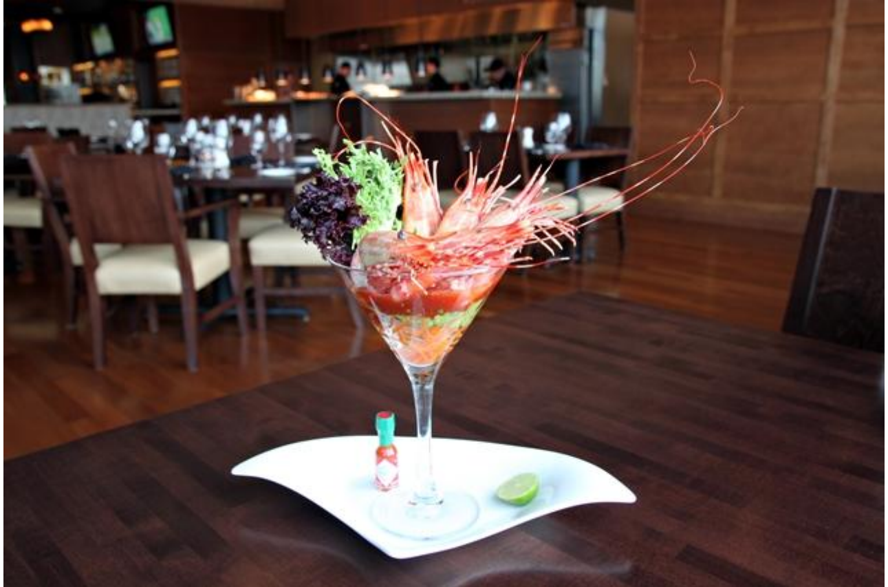
A spot prawn cocktail is the perfect start to a meal at Swinomish Casino & Lodge's 13moons Restaurant